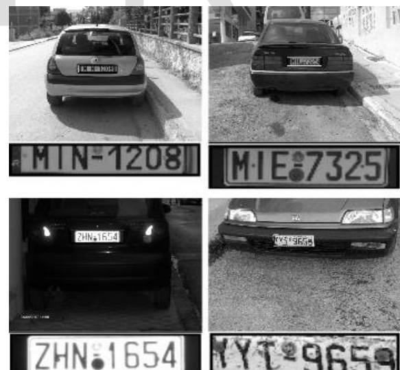
Fig. 1 Sample Image

the optimized character segmentation algorithm, and the trainable character recognition method [9]. An end-to-end real-time scene text localization and recognition method is presented. The real-time performance is achieved by posing the character detection problem as an efficient sequential selection from the set of Extremal Regions (ERs) [10]. The RBM only yields a preprocessing or an initialization for supervised model in its own right. The RBMs can provide a self-contained framework for developing competitive classifiers. RBM (ClassRBM), a variant on the RBM adapted to the classification setting. The different strategies for training the ClassRBM and show that competitive classification performances can be reached when appropriately combining discriminative and generative training objectives [11]. The proposed VLPD algorithm consists of two main stages. Initially, HSI color space is adopted for detecting candidate regions. Geometrical properties of LP are then used for the classification. The proposed method is able to deal with candidate regions under independent orientation and scale of the plate [12].