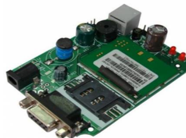
Fig. 7: GSM Module

Global System for Mobile communication (GSM) is an architecture used for mobile communication. Fig. 7 shows GSM Module.