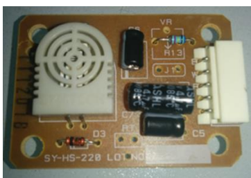
Fig. 10: SY-HS-220 (Humidity)

The PCB consists of CMOS timers to pulse the sensor to provide output voltage. Fig.10 shows SY-HS-220 sensor for Humidity.