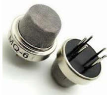
Fig. 8: MQ6