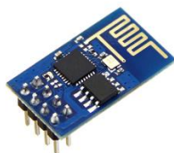
Fig. 4: Wifi Module

It runs on 3.3V and gives our system access to Wi-Fi or internet. Fig.4 shows Wi-Fi Module (ESP8266).