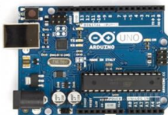
Fig. 2: Arduino UNO

It has 14 digital input/output pins 6 analog inputs, a 16 MHz quartz crystal, a USB Connection, power jack, an ICSP header and a reset button as shown in Fig. 2