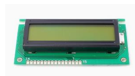
Fig. 6: LCD

It is used to indicate the Air and Humidity in PPM. Fig. 6 shows LCD (16x2).