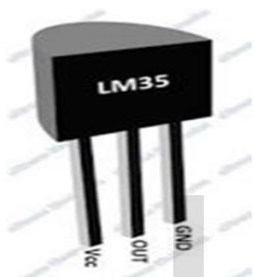
Fig. 9: LM35 (Temperature)

It can be used with single power supplies, or with plus and minus supplies. Fig.9 shows LM35 sensor for Temperature.