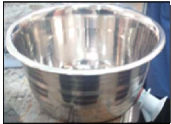
Fig. 5, the central container of the system

ing the produced water to protect the the distilled water from mixing with any pollutants, bacteria, or germs.