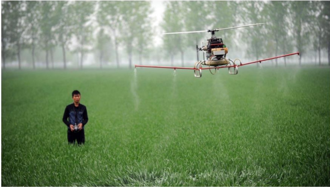
Figure 3 Drone spraying fertilizers [8].