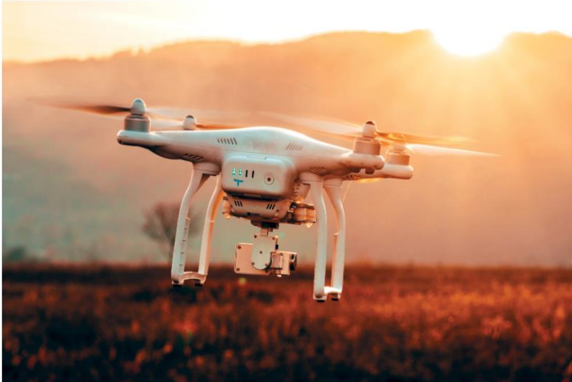
Figure 1 A typical drone [3].