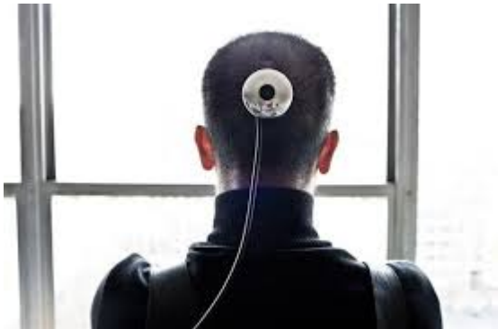
Fig. 3 Cyborg implanted in the central nervous system

By using this technology not only blind people can be assisted but it may also be possible to capture signals responsible for happiness, pain, anesthesia etc. Experiments are also being conducted to establish wireless communication between two persons by placing similar chips, that are capable of using the energy in the body and can transmit and receive impulse signals between them. If this experiment is proved to be possible then "cyborg" which was assumed to be a science fiction is no more a distant dream. With this technique there would be no use of any speech to communicate, just the impulses in the human body can be used to convey the information between each other. Thought communication will place telephones firmly in the history books. Another important application of cyborgs would be in curing diseases. If this type of experiment works, we can foresee researchers learning to send antidepressant stimulation or even contraception or vaccines in a similar manner. With this we can gain a potential to alter the whole face of medicine, to abandon the concept of feeding people chemical treatments and cures and instead achieve the desired results electronically. Cyber drugs and cyber narcotics could very well cure cancer, relieve clinical depression.