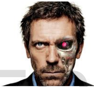
Fig. 1 A human cyborg