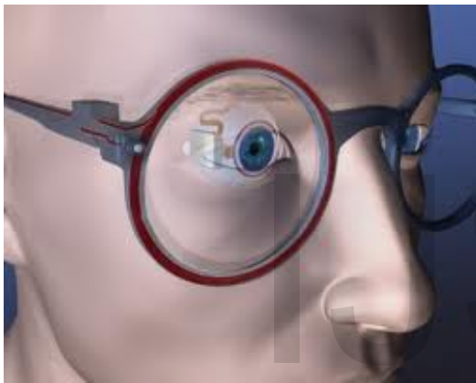
Fig. 2 Working of cyborg from eye

An interesting concept that may ultimately unify the requirements listed is the communication with neural tissue by means of electromagnetic fields. An ideal NIF technology would enable the real-time visualization of thoughts.