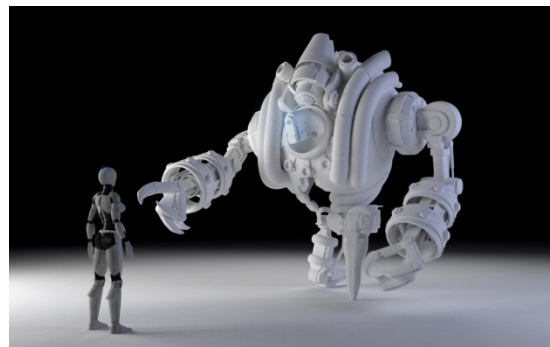
Fig. 5 Cyborg vs robot

Robots and cyborgs seem like the stuff of science fiction and to some degree they are. But what most people do not know is that cyborgs and robots do exist just not in the form that they depict in the movies. The main difference between a cyborg and a robot is the presence of life. A robot is basically a machine that is very advanced. It is often automated and requires very little interaction with humans. In comparison, cyborgs are a combination of a living organism and a machine. It doesn’t necessarily have to be human; it can be a dog, a bird, or any other living thing.