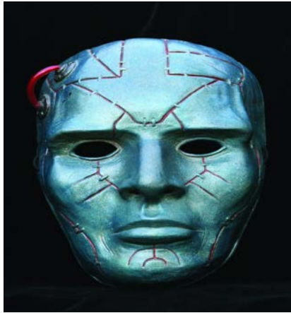
Fig. 6 Cyborg face mask

However, the fusion of humans and machines is not confined to fusion with engineering machinery. Think of machinery as technology in a wider sense. One of the largest modern technological fields is biotechnology. People are helped by biotechnology in the form of medical treatment, but we could be heading toward a scenario in which people are composed of biotechnology. If that is the case, the question must be asked: what are the people who have been integrated with technology in such a way? My background is in western philosophy, which since ancient times has continually asked the question, "What is humankind?" Traditional philosophy was founded on a distinction between human beings and machines (as well as animals), but nowadays technology is beginning to shake this distinction and cyborgs, which are the fusion of humans and machines, really have to be seen as a fundamental phenomenon in philosophical discussions. The question "What is humankind?" needs to be replaced by the question "What is a cyborg?"