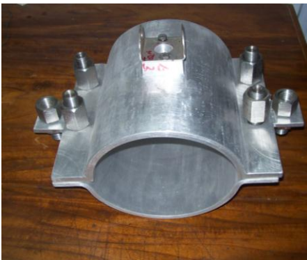
Fig. 4. Split type encirclement clamp (STEC)

The above mentioned BUET report recommended several actions including installation of an outside aluminium sleeve so as to protect the outer surface of the aluminium pipe and seal the flow of water from the reactor tank into the beam port. In line with the recommendation, a split type encirclement clamp (STEC) with silicone rubber lining as shown in Fig. 4, was designed and fabricated locally using Type-6061 aluminium alloy. The STEC was then installed around the segment of the RBP-1, which is located inside the reactor pool at a depth of about 8m by using remotely operated nut-tightening tools which were designed and fabricated locally.