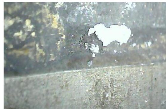
Fig. 3. Inner surface beam port

Upon visual inspection, water condensate was visible inside the polyethylene sheet. This clearly indicated that the corroded part of the graphite plug absorbed moisture from the condensate that had accumulated in the annular space between the plug and the beam port tube. Deposits or scales were found on the outer surface of the lead plug and these deposits consist of species resulting from the corrosion. Photographs obtained from a digital camera inserted into the RBP-1 clearly showed the corrosion damages in the form of metal removal and pits on the inner bottom surface of the aluminium pipe. It also revealed that the damage in the form of pits had initiated at the interface between the stainless steel aluminium. Brown stain marks were observed on the stainless steel surface but no pits or metal removal was found on the stainless steel surface as shown in Fig. 3.