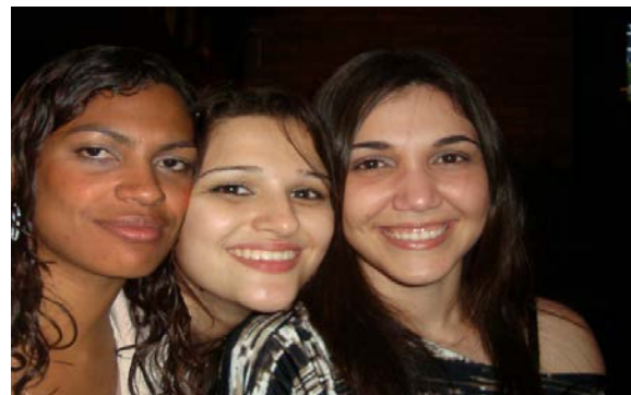
Figure 1: Example of a spliced image involving people

Digital Image and Video Forensics research aims at analyzing the underlying facts about an image or video. Its main objectives comprise: tampering detection, hidden data detection or recovery and source identification with no prior measurement or registration of the image. Several techniques have been developed to detect various forms of digital tampering. When assessing the authenticity of an image, forensic investigators use all available sources of tampering evidence.