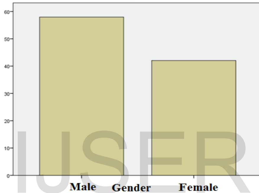
Figure 2: the frequency distribution of studied samples based on the gender

According to table 3, the number of males and females participated in the statistical sample are 173 and 124, respectively. Thus, the frequency percentage of males and females are 58% and 42%, respectively; as a result, it is concluded that the male frequency is higher than the female one.