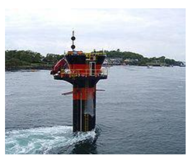
Fig. 1. The world's first commercial-scale and grid-connected tidal stream generator.

Tidal stream generators are the cheapest and the least ecologically damaging among the three main forms of tidal power generation.