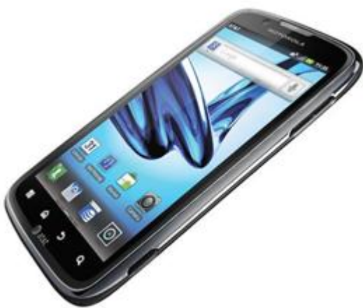
Fig.1. Sample Android Phone used in Implementation We have implemented a proof-of-concept prototype using Android, an open-source mobile OS initiated by Google.

The main reason behind our choice is that Android OS is open source and gives more degree of freedom during implementation of system.